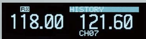
Operating information is clearly shown on the OLED display.

A fixed mount VHF airband first! The IC-A210 has an organic light emitting diode (OLED) display. The OLED display emits light by itself and the display offers many advantages in brightness, vividness, high contrast, wide viewing angle and response time compared to a conventional display. In addition, the auto dimmer function adjusts the display for optimum brightness at day or night.