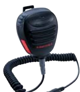
Submersible Mic Plug