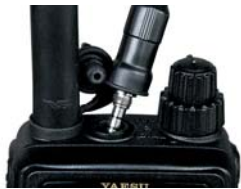
Waterproof Connectors and Microphone Jack