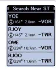
Near station search function screen

The near station search function assists you in accessing nearby ground stations. The function searches for nearby stations using the station memories that have GPS position information. To use the near station search function, location data and frequencies of the ground stations must be programmed.