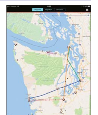
RS-AERO1I map screen example ©2017 Google-Map data ©2017 Google

The following four functions are available: create a flight plan, set Direct-To NAV, display flight plan information and display waypoint information.