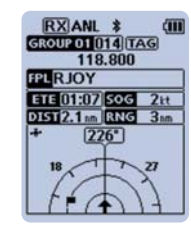
Waypoint NAV screen

The simplified waypoint NAV guides you to a destination by using current position information from GPS (also GLONASS and SBAS). The waypoint NAV has two functions: Direct-To NAV and Flight Plan NAV. Up to 10 flight plans and 300 waypoints can be memorized in the IC-A25NE.