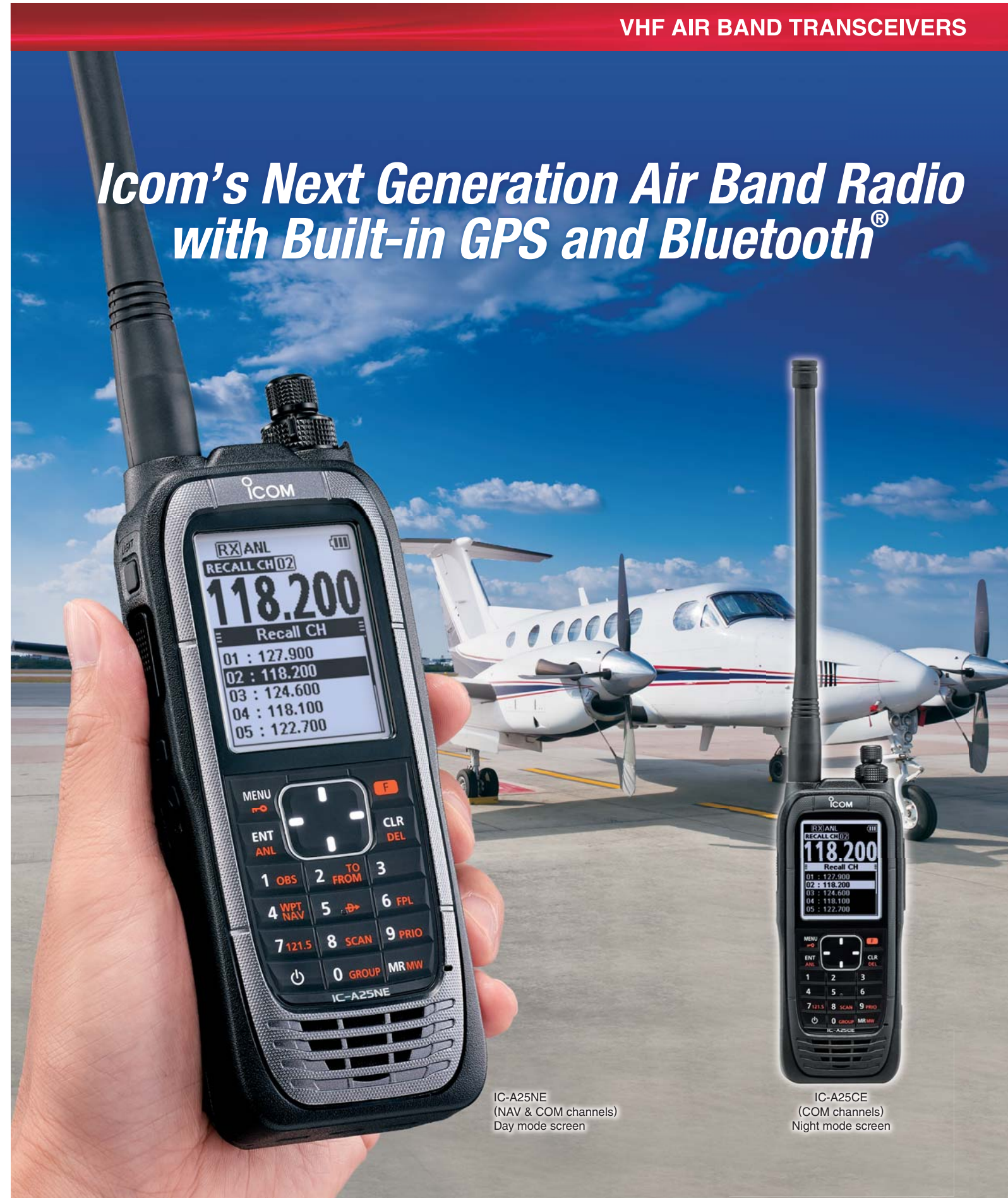
IC-A25NE (NAV & COM channels) Day mode screen