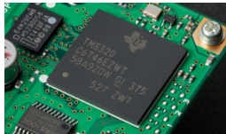
32-bit High Speed Floating Point DSP

The 32 bit high speed floating Point DSP (max 3000 MIPS) provides effective cancellation/reduction (DNR) of the random noise that is frequently frustrating in the HF frequencies. Also: the AUTO NOTCH (DNF) automatically eliminates the dominant beat tone. The CONTOUR, and the APF, are very effective receiver noise reduction tools in the HF bands operations. The YAESU original DSP QRM and noise reduction functions are provided.