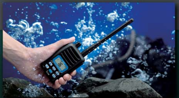
Photo includes optional speaker-microphone, HM-138.